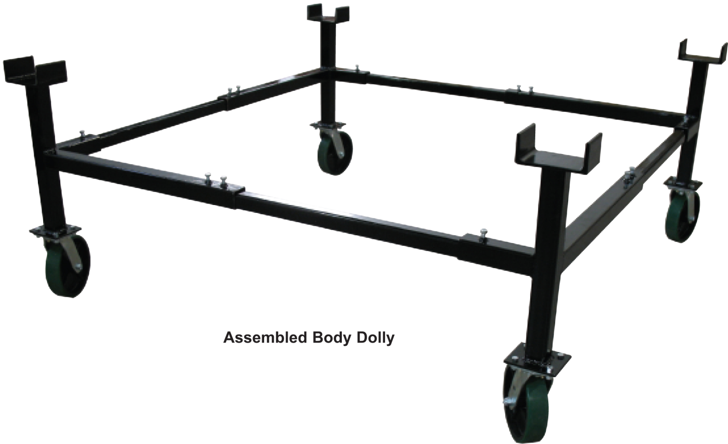
Assembled Body Dolly

Adjust Dolly to desired width by sliding extension arms in or out and then securely tightening the locking bolts. For safety reasons NO RED PAINT should be showing on the Extension Arms. If red paint is visible then slide bracket into the the Corner support arm until it is no longer showing.