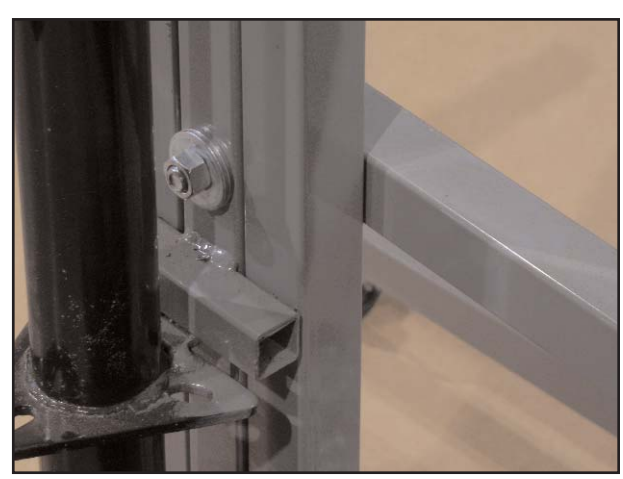
Insert washers and fully tighten nut on bolt of the Panel Rest (D).

Insert Straight Bolt (G) in between the 2 posts of Top Support Extension (C) and tighten with washer and nut. Repeat for Curved Bolt Assembly (H). Note: Make sure Curved Bolt is in front of Straight Bolt.