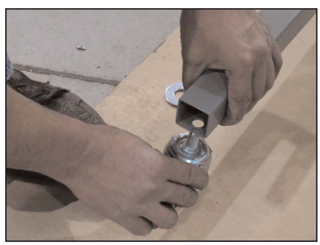
Insert post of Caster (E) in the bottom of Main Body (A).