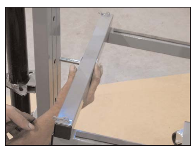
Insert Panel Rest (D) into desired hole of the Panel Jack (B).