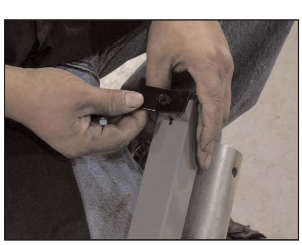
Remove black plate from Panel Jack (B).