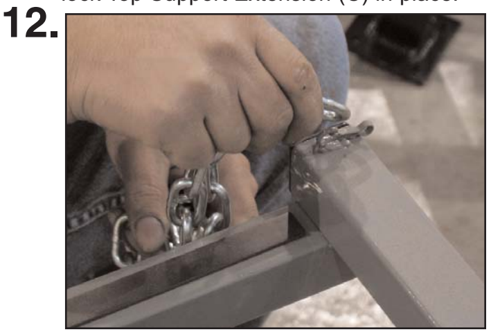
Insert Chain (I) into hook on side of Panel Rest (D). Repeat on other side of Panel Rest (D) with second Chain (I).

Select desired height of Top Support Extension (C). Insert Knob (F) into top hole of Panel Jack (B), tighten knob to lock Top Support Extension (C) in place.