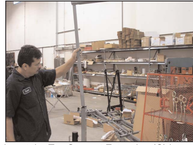
Insert the Top Support Extension (C) into Panel Jack (B).