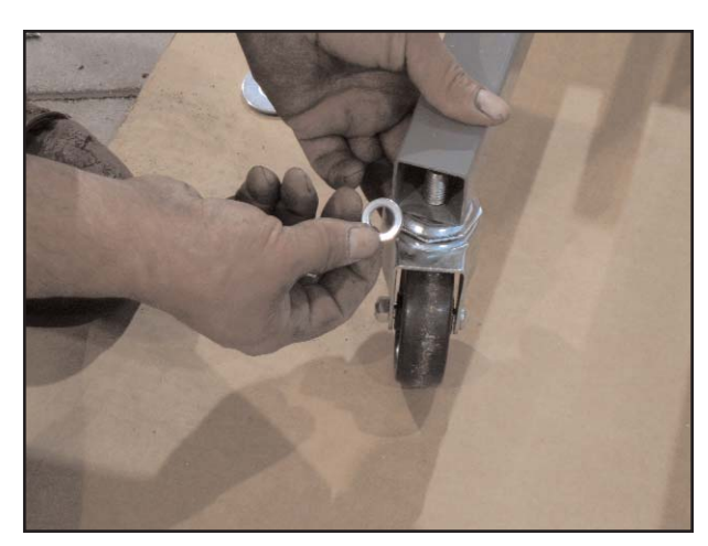
Place locking washer on post of Caster (E) and fully tighten nut. Insert cap from Caster Assembly (E) on end of Main Body (A) post. Repeat on all 4 corners of Main Body.