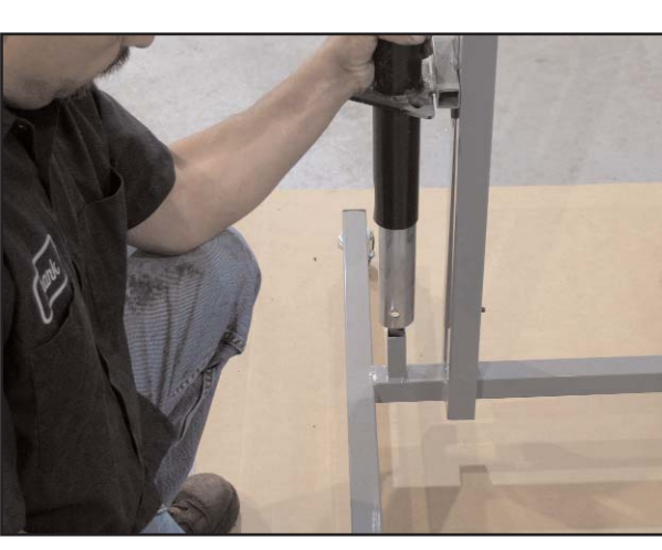
Place bottom of Panel Jack (B) onto post on the base of the Main Body (A).