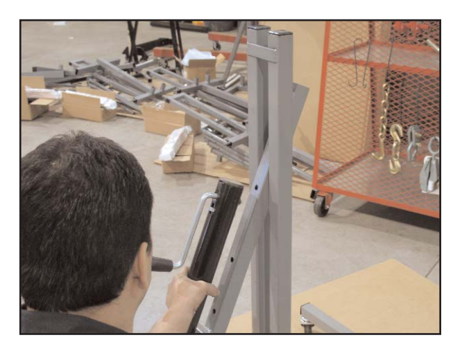
Slide top of Panel Jack (B) in between the two upper posts of Main Body (A).