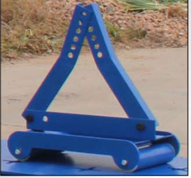
Universal Wheel Stand & Dead Vehicle Dolly