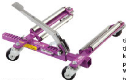
4520 Left Hand Shown 5211 and 6313 Left Hand Available

The Model 6313 is an ox. Able to accommodate vehicle weights to 6,300 lbs. (1,574 lbs. per wheel), including light duty trucks with tire widths up to 13 inches wide and 36 inches tall. This unit is the most versatile and strongest GoJak® in the line. It has steel rollers, wider axles and two heavy-duty 5-inch diameter, and two 4-inch diameter, double-ball raceway casters. This combination makes for easier rolling with heavier loads. The Model 6313 has a 5-degree offset pedal for additional foot-to-tire clearance. The under frame clearance is 2-1/2 inches as is 5211 which is very useful when pulling cars up flatbed trucks. Available in left and right hand units.