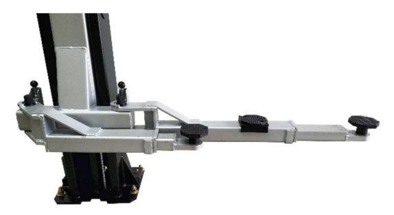
Asymmetric Swing Arm Configuration