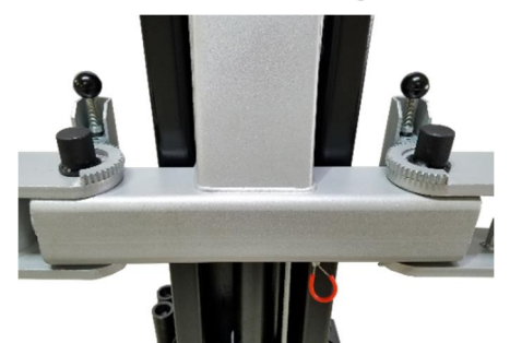
Dual Point Lock Release & Swing Arm Restraints