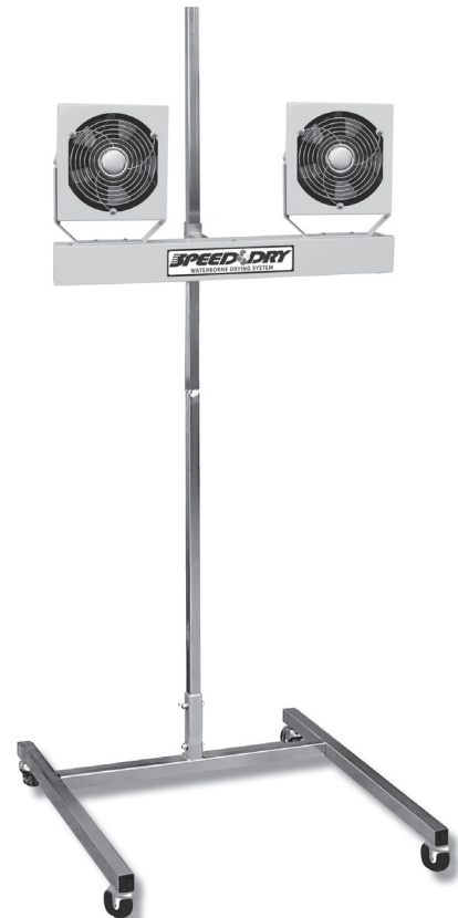
MODEL SPEED DRY Part No. 15-1000

The Speed Dry uses a total of 64 watts or roughly $ .08 per day, when used continuously. It is 12 times more expensive to operationally run a single compressed air venturi.