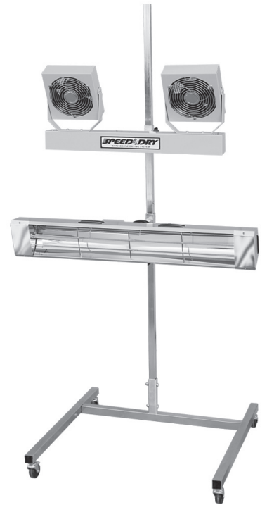
MODEL SPEED DRY with Heater Part No. 15-1015

When used in conjunction with electric infrared it provides the fastest dry times available.